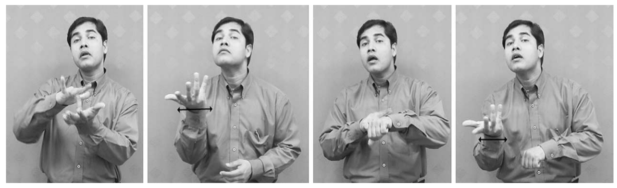
Figure 5 Combinations with the Indo-Pakistani Sign Language question word (WH): PLACE+WH "where", TIME+WH "when".