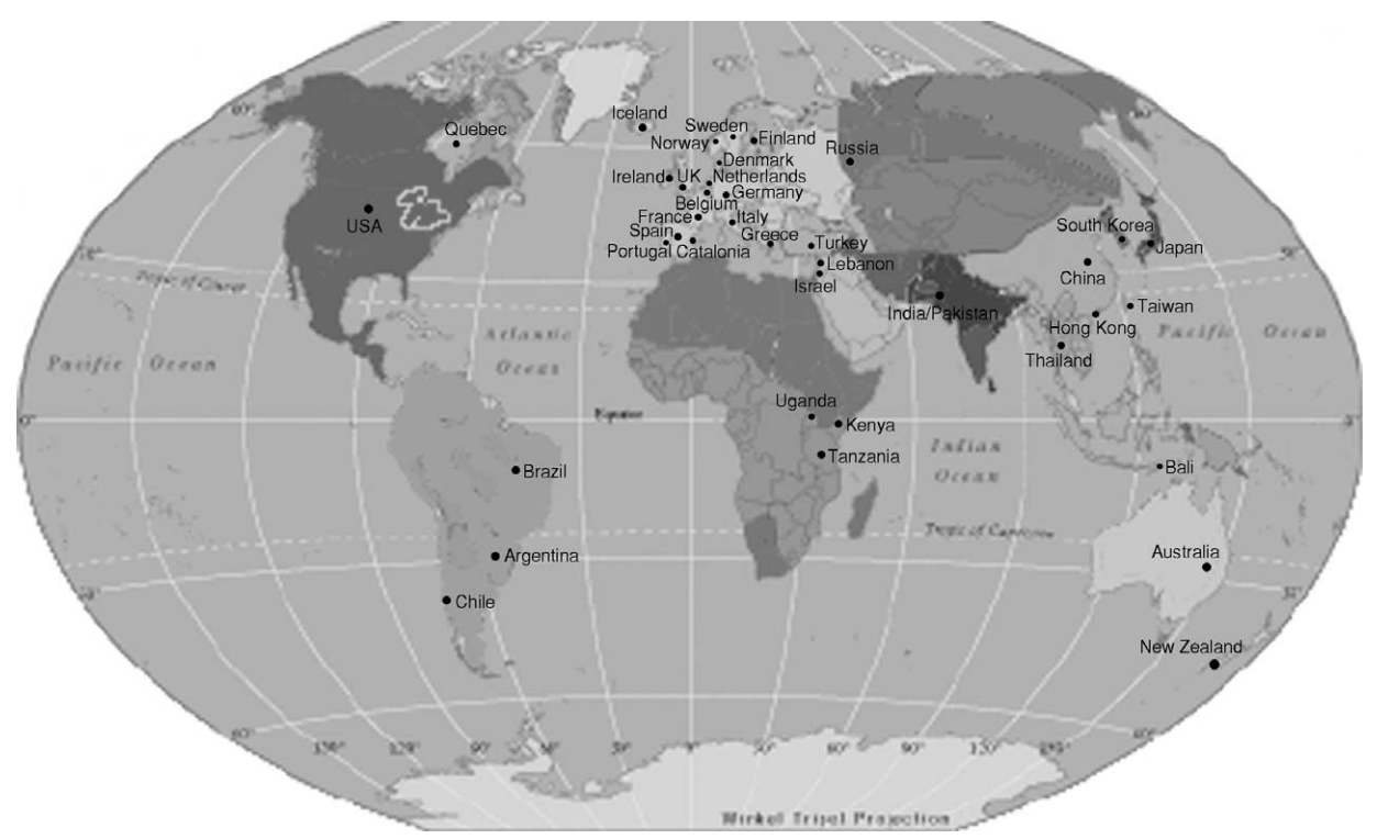
Figure 6 Sign languages represented in the typological survey on questions and negation.

documentation carry considerable momentum. Some sign languages are endangered, whereas others are expanding in geographical spread and contexts of use, and some are only just being created by new communities of users. Forces such as intensive contact between sign language and spoken language, as well as between one sign language and another, and the move toward official recognition for sign languages and the deaf communities that use them rapidly change and reshape the makeup of many sign languages worldwide. It is a continuous challenge for sign language linguistics to keep up with these developments and put together an increasingly detailed picture of linguistic diversity among the world's sign languages.