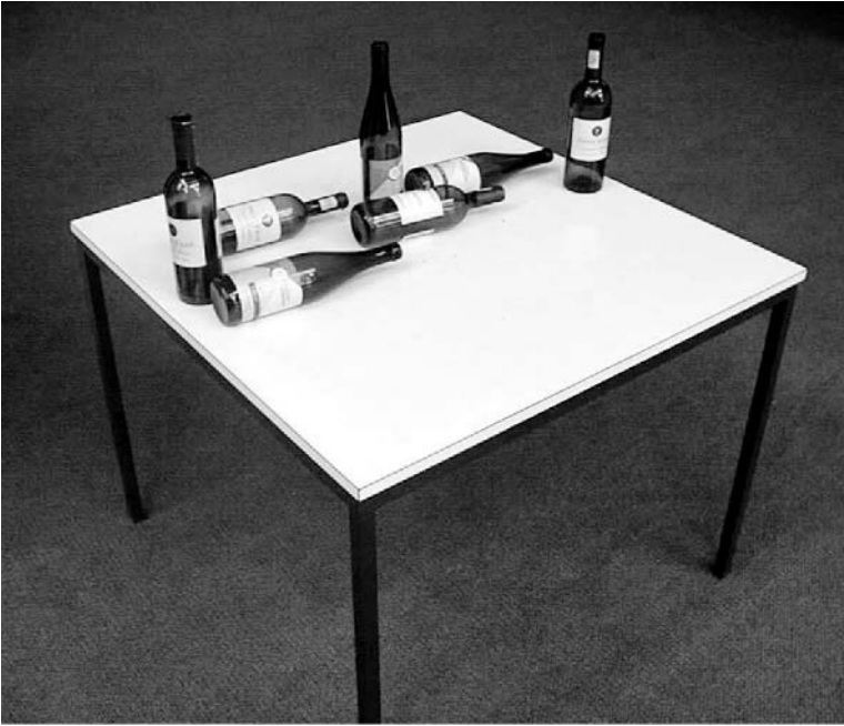
Figure 2. Three bottles standing and four lying on table top (PSPV 46)

and so forth. The full set is published in Levinson and Wilkins (2006: 570–574), but is also available from the Max Planck Institute for Psycholinguistics website ( www.mpi.nl ).