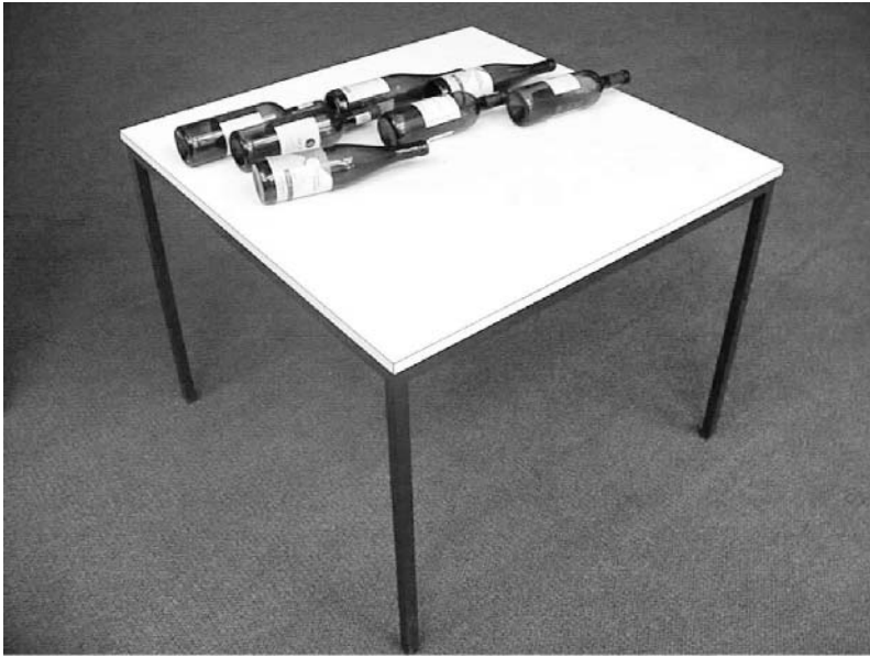
Figure 3. Seven bottles lying on table top (PSPV 52)

languages would describe Figure 3 with a ‘lying’ verb, some small-set positional verb languages would permit Figure 2 to be described solely with a ‘stand’ verb, while no large-set positional verb language would permit this. This proves to be true for e.g., Yéli Dnye (as small-set language) and Tzeltal (a large set one). The full set of photos is available from the Max Planck Institute for Psycholinguistics Web site ( www.mpi.nl ).