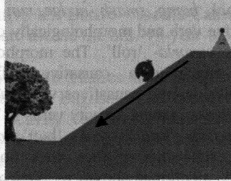
Resulting subevent (tomato man rolls down)