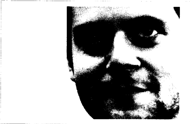
Figure 10-3. What emotion is this face signaling?

Try it yourself. Consider the photo in Figure 10-3.