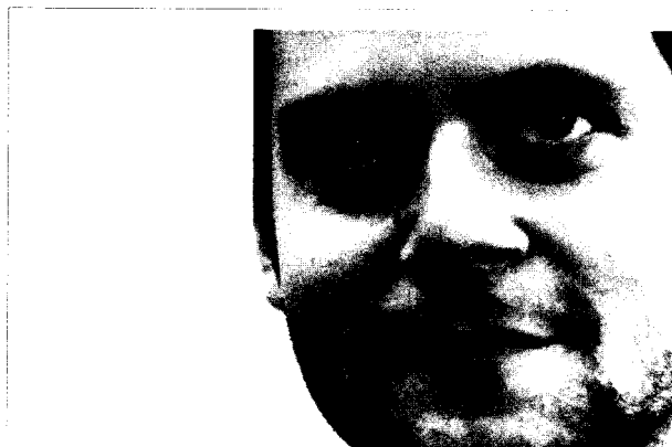
Figure 10-3. What emotion is this face signaling?

Try it yourself. Consider the photo in Figure 10-3.