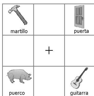
Fig. 1: Example of display with pictures and printed names.

In Spanish, definite articles mark the gender of nouns. To avoid gender cues, we by embedded targets in the article-free carrier Selecciona:... ‘click on:...’. Spoken instructions were recorded onto minidisk by a female native speaker of Mexican Spanish, sampling at 44.1 kHz (later down-sampled to 22 kHz). Target noun onsets