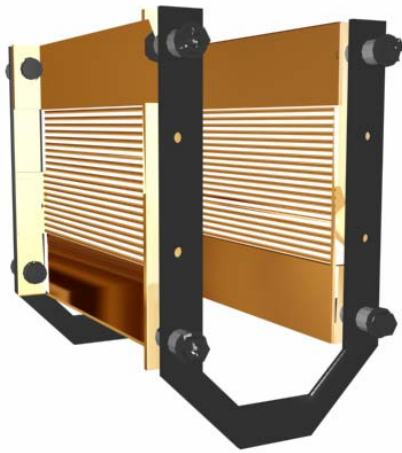
Figure 2: 15° electrostatic parallel plate deflector with central mesh for the detection of light charged fragments.

Injection as well as part of the 90° bending in the corner section will be realized with a parallel plate deflector as shown in Fig. 2.