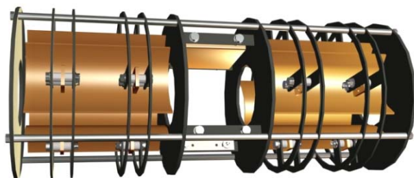
Figure 4: Electrostatic quadrupole doublet with integrated steerer

The distance between the two quadrupoles was extended to 150 mm, which completely decouples the fields of the elements. In case the beam is disturbed by e.g. field errors, small voltages can be applied on the vertical steerer to counteract beam shifts. The horizontal steering is achieved by parallel plate deflectors, where small voltages can be added, if necessary.