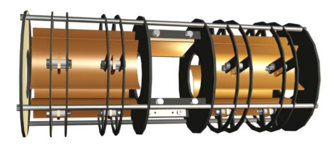
Figure 4: Electrostatic quadrupole doublet with integrated steerer

The distance between the two quadrupoles was extended to 150 mm, which completely decouples the fields of the elements. In case the beam is disturbed by e.g. field errors, small voltages can be applied on the vertical steerer to counteract beam shifts. The horizontal steering is achieved by parallel plate deflectors, where small voltages can be added, if necessary.