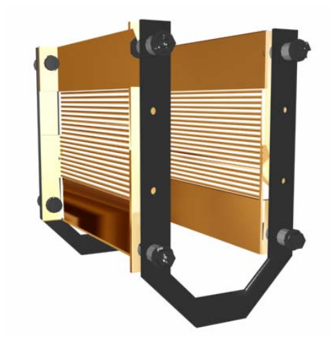
Figure 2: 15° electrostatic parallel plate deflector with central mesh for the detection of light charged fragments.

Injection as well as part of the 90° bending in the corner section will be realized with a parallel plate deflector as shown in Fig. 2.