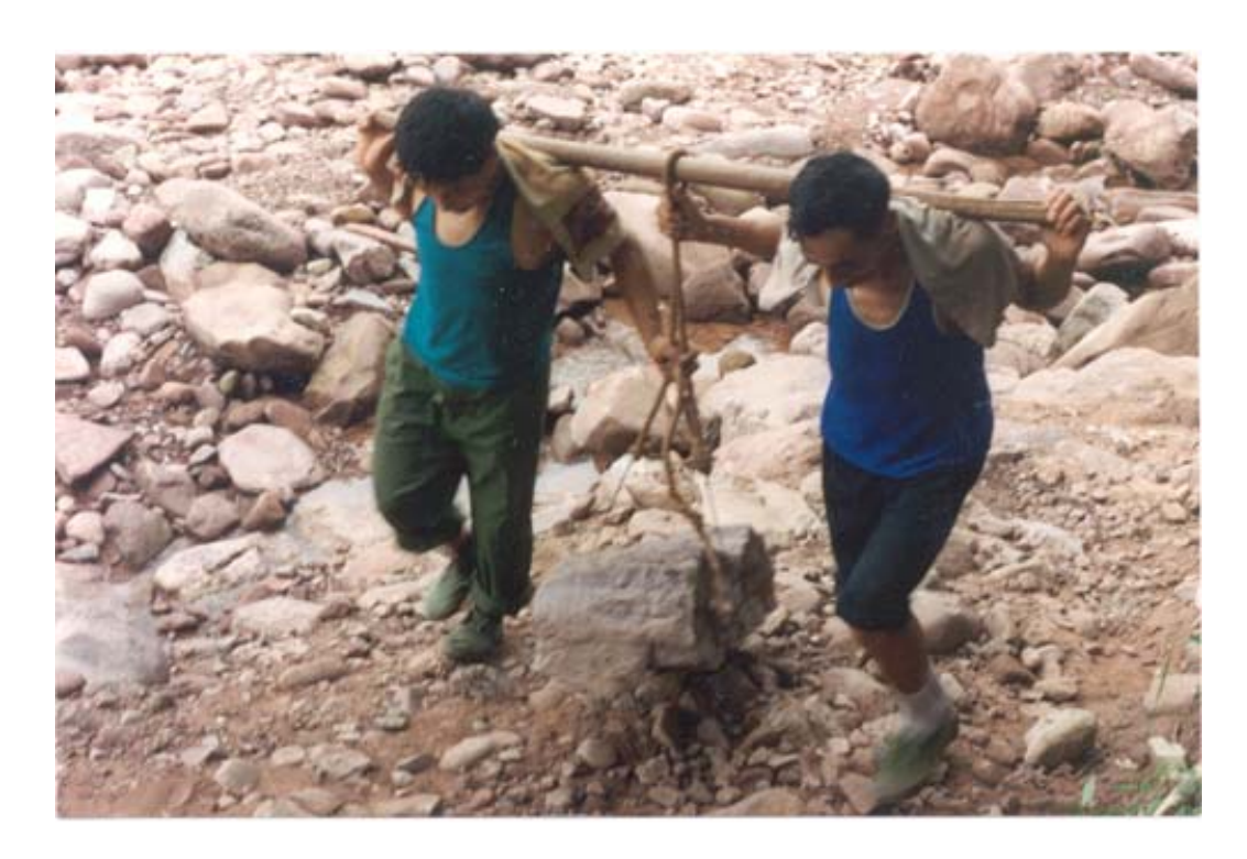
Figure 7. Quarrying rock in the riverbed below Bifeng gorge.

township government had been able to arrange an exception to the ban as part of their agreement with Wanguan.<sup>23</sup>