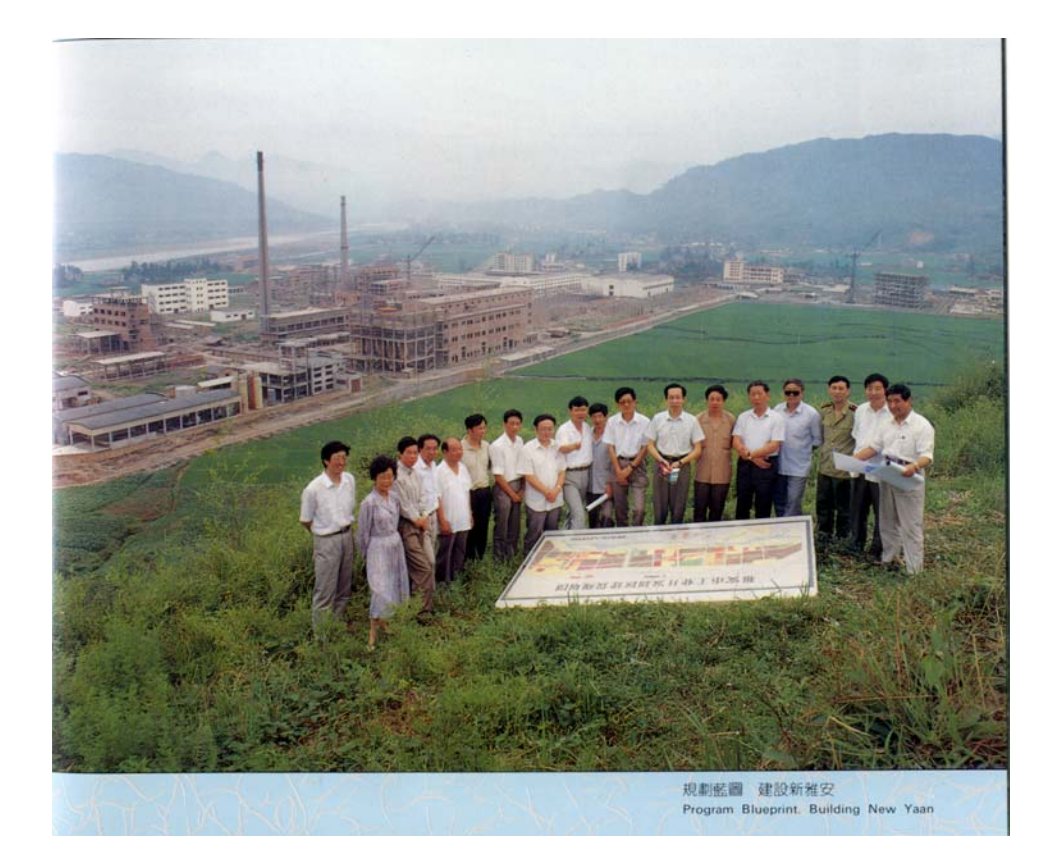
Figure 4. Photo of the Ya'an paper mill from the city's official literature.

The paper mill incident took place during our initial fieldwork in the Ya'an area, between the fall of 1991 and the end of 1993. It was a time of deepening market reforms that changed the role of government officials, especially those at the county and township levels. These officials were now encouraged to be more self-supporting by developing local sources of revenue instead of depending solely on funding from higher levels. Local villagers began to express apprehension about what they perceived as economic and social instability accompanying this policy shift, to the point of questioning the legitimacy of the township government leadership. Many villagers complained that the township officials no longer fulfilled their moral obligation to serve the people, and that they had become parasitic, caring only about making money. In this climate of suspicion and apprehension, the issue of zhandi was symbolically charged beyond its immediate economic effects. Over the last ten years, the frequency and intensity of conflicts surrounding zhandi have only increased.