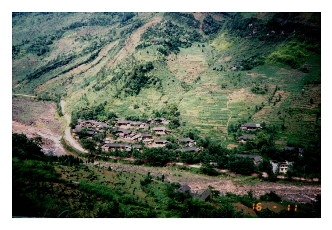
Figure 2. Dryland agriculture on steep slopes.

In the first half of the twentieth century, before the socialist revolution, agriculture was the main source of livelihood in these villages, with indigo, opium, and tea the most significant cash crops. According to local people, the area was heavily forested with Chinese fir, but timber was lightly harvested, used mostly for furniture and coffins. Low market demand and difficult transportation also limited the harvesting of timber. Families cooperated in agricultural production, especially through the practice of trading labour, and most families owned some cropland as well as forest land. Landholdings in the "old society" were generally equal, with relatively little difference among the majority of the village families, although a few wealthy landlords and some landless poor did exist, especially as opium became an important commodity in the chaos of warlords and banditry that dominated the 1920s - 1940s.<sup>13</sup> We were told that there were many property disputes in those times, most of them involving inheritance, but these were settled in local tea-house courts through the