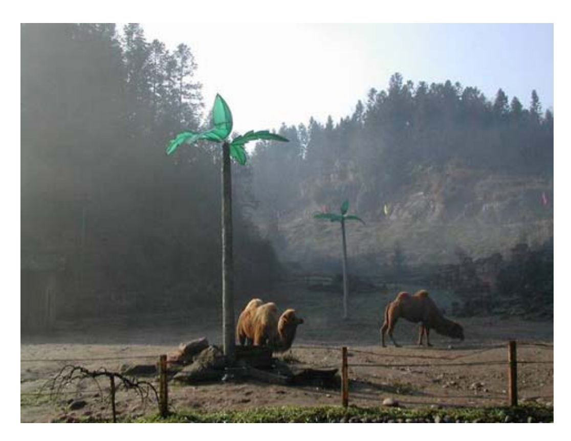
Figure 6. Bifeng Gorge Zoo in 2002.

a "back to nature" retreat from the crowded, noisy urban environment<sup>22</sup> and as a key project preserving the natural environment through eco-tourism.