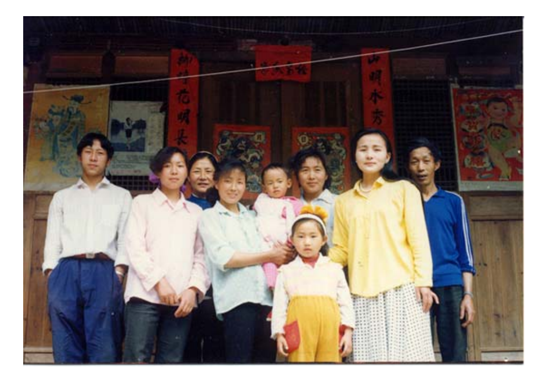
Figure 3. Large family of the baby-boom with mostly daughters.

Because families at the time of the initial division were the large families of the baby boom, and because of the patrilocal marriage pattern, the numbers of daughters versus sons had a lingering effect on the size of household landholdings. A family with many daughters who then moved away would have more land per person than a family with many sons who then had to accommodate daughters-in-laws moving in. Villagers have contended with such fluctuations by allowing others within the village to farm plots that they lack the labour to farm themselves, or by opening fallow land on the mountain. When we asked what the rent payments were for grain plots on her surplus land, one older woman, sensitised by decades of class struggle and the intimacy of village social relations, was taken aback at the suggestion that she might "rent" that land to fellow villagers. The person who uses the land of a fellow villager does so by private arrangement, and is simply responsible for paying the tax on the land. If problems arise, the mediation of the senior men in the lineage or the village head ( duizhan ) may be sought.