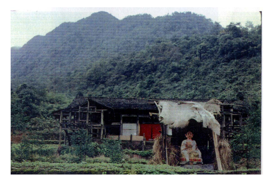
Figure 5. Bifeng Temple in 1992. Photo: Pamela Leonard 1992

When we next returned to the area, we discovered that a World Bank-funded reforestation project was underway in the national forest behind the temple. Contract workers from the south of the prefecture were cutting and burning the mixed deciduous woods to make way for mono-crop replanting in Chinese fir.<sup>20</sup> In general, local people said they were not concerned, that it was national land and they did not use it for much.<sup>21</sup> Nevertheless, there were some critical voices besides our own in that location, and this came out when we went into the temple.