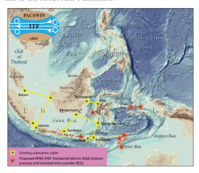
Figure 2. Submarine cables in the Indonesian seas (You et al., 2009) and proposed EFS/IES (E-field sensor/inverted echo sounder) for the straits without a cable.

Several submarine cables cross straits through which the ITF flows (Figure 2). In particular, two cables cross Makassar Strait, which contains the majority (estimated at 70-80%) of the ITF transport. PACSWIN has set the submarine cable as one of its priority monitoring components along with ADCP and XBT using commercial ships, satellite, moorings and floats. The cable routes in the Indonesian seas avoid the magnetic equator, which lies to the north near Mindanao.