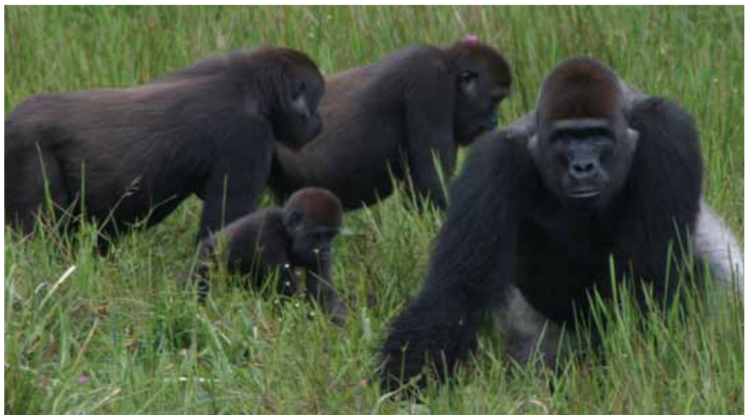
A group of western lowland gorillas ( Gorilla gorilla gorilla ), consisting of a silverback, two females and an infant, feeding on vegetation in a forest clearing.

In 1993, the ITTO in collaboration with IUCN, published guidelines for the conservation of biological diversity in tropical production forests. This document highlighted the need for conserving biodiversity at the landscape level and provided stakeholders with activities to consider when planning conservation strategies in the context of production forests such as timber concessions. For over a decade, many projects and activities funded by ITTO have been implemented in tropical production forests providing an increased knowledge base on management intervention measures that have proven beneficial to sustainable forest management. Building on the experience and scientific knowledge gained, the ITTO are now revising these guidelines. The Guidelines for the Conservation and Sustainable Use of Biodiversity in Tropical Forests (IUCN/ITTO, in prep.) provides an updated list of recommended actions for improving biodiversity conservation in production forests, which can be subsequently adapted by forestry managers to local circumstances. The ape-specific guidelines presented in this document should be viewed as complementary to these efforts in providing detailed information for activities to conserve gorillas and chimpanzees in the production forests of WEA.