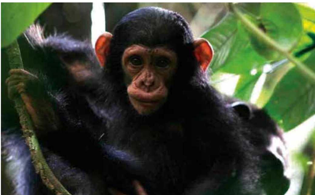
A young central Africa chimpanzee ( Pan troglodytes troglodytes ).

Western Equatorial Africa (WEA includes Cameroon, Central African Republic, Gabon, Equatorial Guinea and the Republic of Congo) encompasses the complete geographical range of two sub-species of African apes, the western lowland gorilla ( Gorilla gorilla gorilla ) and the central chimpanzee ( Pan troglodytes troglodytes ). 1 The region has long been considered a stronghold for the conservation of chimpanzees and gorillas because of the abundance of apes and remoteness of many large forest blocks. This perspective is changing with the increasing threat of poaching, disease, and habitat loss or degradation. For example, ape populations in Gabon were halved in less than 20 years by a combination of bushmeat hunting and Ebola haemorrhagic fever (Walsh et al. 2003). Both gorillas and chimpanzees reside in tropical forests containing valuable timber trees, and harvesting of timber plays an important role in the economy of ape habitat countries.