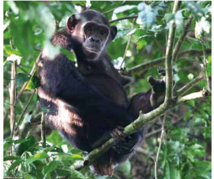
A subadult female chimpanzee (Pan troglodytes troglodytes), Republic of Congo.

Although mechanized logging is often cited as the primary cause of faunal decline in tropical forests, our knowledge of the precise impact of logging on most mammal species and on forest dynamics is still incomplete (Johns and Skorupa 1987; Skorupa 1988; Johns 1992; Struhsaker 1997; White and Tutin 2001; Meijaard et al. 2005). Timber extraction and associated activities can alter ape habitats, affect food resources, disrupt social groups, fragment populations, and increase exposure to diseases. Hunting pressure also often increases due to improved access to remote forests via the transport networks constructed by forestry companies (Wilkie et al. 1992; Auzel and Wilkie, 2000). Even low hunting pressure adversely affects apes because they are long-lived species with slow rates of reproduction. Recent research suggests that following any dramatic decline, ape populations can take up to 120 years to recover (Walsh et al. 2003). Therefore, it is important to consider both direct and indirect effects of logging on resident ape populations when developing strategic plans to maintain high conservation value forests.