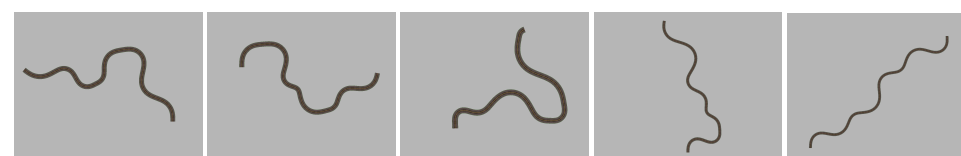
Figure 3: Street Set B