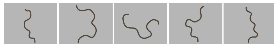
Figure 2: Street Set A