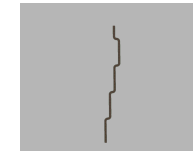
Figure 1: Street used in Exp 1

Training: Visual feedback was delayed by 280ms. The slowest speed was repeatedly presented until one of 3 criteria was met. If the success criterion was met, the next faster speed was presented. If either of the other 2 criteria were met, then training ended.