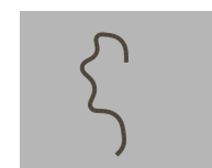
Figure 4: Training street

Post-Test: The post-test was identical to the pre-test, with the single exception that 5 new paths were used: The subjects who saw Street Set A for the pre-test, saw Set B for the post-test, and vice versa (see Figs 2,3).