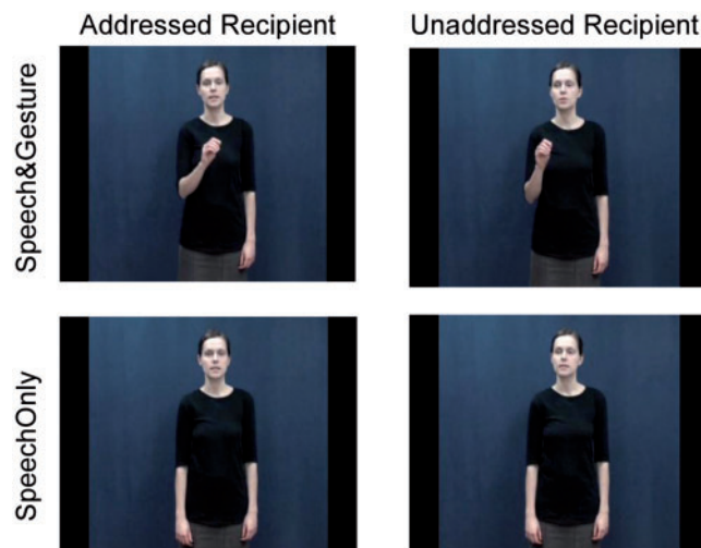
Fig. 2 Example of stills from the four types of video stimuli used.

One of our aims was to avoid confounding the visual angle of the gestures in the addressed and unaddressed conditions with recipient status signaled through eye gaze direction. Thus, rather than showing the same gestures recorded from a lateral and a frontal visual angle, the confederate speaker repeated each stimulus sentence, including the