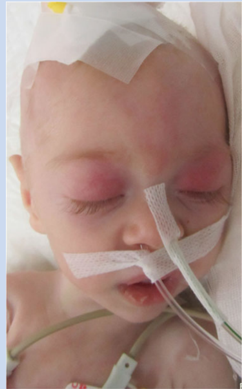
FIG. 1. Clinical photograph of our patient at 2 months of age showing generalized hypopigmentation relative to the parents.

Whole-exome sequencing (WES) was performed on DNA samples of the family trio (Proband 1 and his parents). The study was