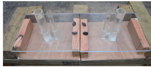
Figure 9. Uncovered U-tube experimental set up. doi:10.1371/journal.pone.0103049.g009