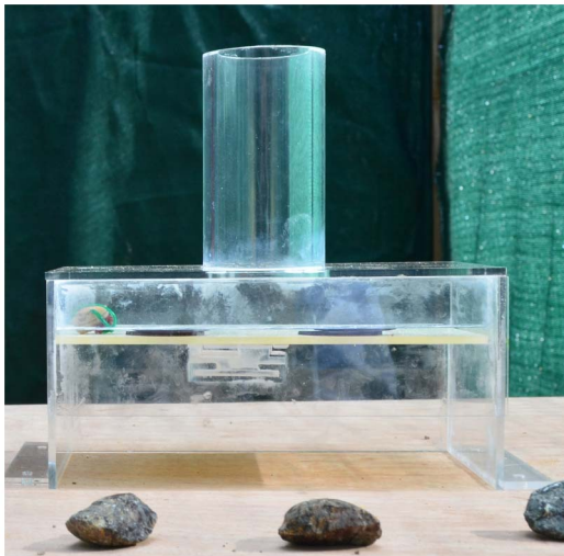
Figure 1. Single stone dropping apparatus. doi:10.1371/journal.pone.0103049.g001