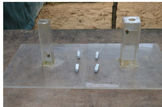
Figure 7. Narrow and wide tubes with unequal water levels. doi:10.1371/journal.pone.0103049.g007

This experiment consisted of two apparatuses, each containing a standard tube and a small tube (small tube: outer diameter = 25.4 mm, inner diameter = 19 mm) 25 mm apart, with 170 mm sticking out and 80 mm below a clear cast acrylic lid (300×400×12 mm) on a wooden box (Figure 8). The lid was covered with paper to prevent subjects from observing the tubes underneath. The small tubes contained food. Stones were too large to drop into the small tubes; they could only be dropped into the standard tubes. Under the lid, one apparatus had a tube (outer diameter = 25.4 mm, inner diameter = 19 mm) that connected the standard and small tubes such that when stones were dropped into the standard tube, the water in the small tube would also be displaced, raising the food reward. The other apparatus did not have a connector tube, thus it was non-functional. Each apparatus,