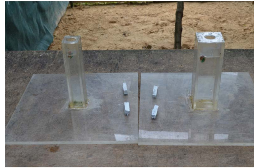
Figure 6. Narrow and wide tubes with equal water levels. doi:10.1371/journal.pone.0103049.g006

switched from erasers to clay objects because Damien began eating the erasers. Therefore, Q, 007, Kitty, and Lady had erasers for objects, while Damien and Buster had clay objects. Objects were placed between the tubes as in the sand vs. water experiment.