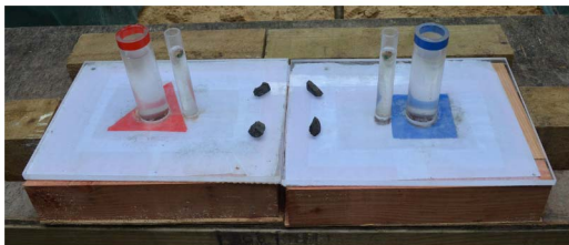
Figure 8. Colored U-tube experimental set up. doi:10.1371/journal.pone.0103049.g008

If, during the experiments involving two tubes, a bird showed a side bias, the trials were paused and 5–20 trials of color choice were given, after which the experiment was restarted. The color choice test draws their attention to color rather than space and can break their pattern of always choosing one side without attending to the details of the task. In the color choice test, birds were presented with two PVC tubes (diameter = 32.5 mm, length = 45 mm glued to two 45×45 mm pieces of plywood): one gold tube that always contained meat and one silver tube that never contained meat. The tubes were placed, left side first, in a pseudorandomized order on the table and oriented such that the bird could not see into the tube without approaching it. The first tube approached and looked into was considered the chosen tube and once the bird left that tube, the trial was stopped. All birds were trained on the color choice test to an accuracy of at least 17 successful trials out of 20 before beginning the water tube experiment.