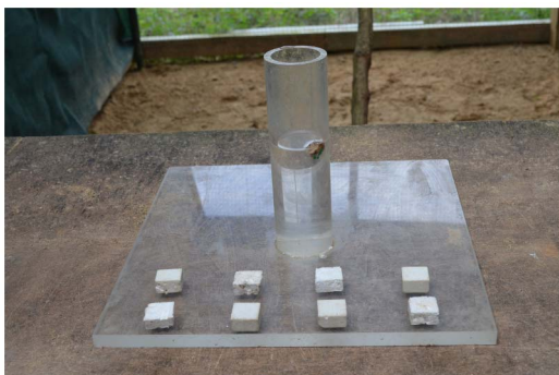
Figure 5. Sinking vs. floating experimental set up. doi:10.1371/journal.pone.0103049.g005

(44×44×174 mm, volume = 336,864 mm 3 ) tubes were made out of clear cast acrylic sheets and glued to 300×300 mm bases (Figure 6). Both tubes had clear cast acrylic lids with holes of the same diameter (25 mm) to equalize how far the bill could reach through the hole into the tube. The relative differences in volume between the standard cylindrical water tube (213,628 mm 3 ) and the wide and narrow tubes were roughly equivalent (wide tube = 123,236 mm 3 larger than standard tube and narrow tube = 113,404 mm 3 smaller than standard tube). Birds had access to four objects of the same type (8–10 g erasers that displaced 9 mm in narrow or 1 mm in wide tube, or 5–7 g fimo clay cuboids that displaced 9 mm in narrow or 3 mm in wide tube; both objects were 40×10×10 mm) with metal handles on one end. We