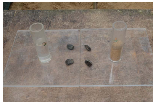
Figure 3. Water vs. sand experimental set up. doi:10.1371/journal.pone.0103049.g003

In this experiment, the narrow tube was the functional tube because the water levels in both tubes were set to the narrow tube's reachable distance. Since the wide tube required more objects to make the water rise the same distance, the food would not come within reaching distance even if all four objects were dropped in. The narrow (24×24×174 mm, volume = 100,224 mm 3 ) and wide