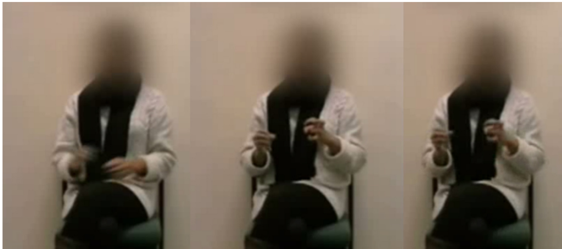
Fig. 2. Clip in which the speaker produces a gesture containing information about the sensation of pain (cramping/squeezing/tightening) that is not contained in the accompanying speech (“it’ll usually come on quite suddenly”).

allow the identification of any ‘additions’ that were traceable to gestures (i.e., information contained in gestures that was not contained in the speech). The analysis of the original video clips revealed that thirteen dimensions of pain were depicted within the speech and/or gestures (see Table 1).