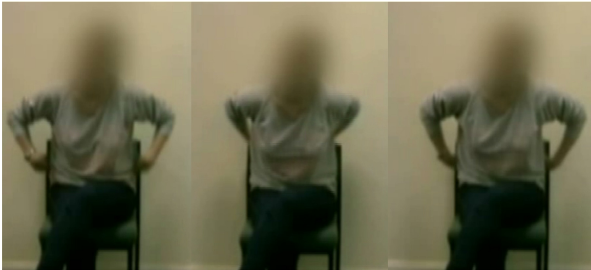
Fig. 1. Clip in which the speaker produces a gesture containing information about the location of the pain (lower back) that is not contained in the accompanying speech (“it just aches it’s a dull ache all the time across my back”).

whether the gesture contributes any additional information that is not contained in the speech (i.e., is non-redundant with respect to speech; see Fig. 1 for an example; see Reliability section for reliability procedures). This analysis yielded 48 clips in which the gesture(s) contained additional information about pain. We randomly selected one clip from each speaker, yielding 21 clips ( Mean length = 7.48 s; Range = 2–17 s). One clip was randomly selected to be used in the practice trial of the experiment, while the other 20 appeared in the experiment proper.