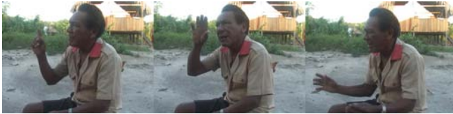
[POINT ‘as it was getting into afternoon’]

The time references occur together with specific types of spoken material, generally with predicates (like yande kuéma ‘it got light’) and predicate modifiers, often with deictic words ( ikeré kurasí ‘(when) the sun is still here’). While spoken adverbs usually modify through linear contiguity with a predicate, these time references have the possibility of simultaneous expression with a predicate or other spoken material. One way of looking at these time references is as one of several resources that combine to determine the temporal and aspectual semantics of the verb phrase (the ‘verb constellation’; Smith 1997). The two distinct ways of performing time reference—as a stationary point or as a sweep across the sky—contribute two different aspectual meanings: punctuality versus durability. When events are construed as instantaneous, such as killing a monkey in example 3 below, they tend to combine with stationary pointing (here with an open hand shape—possibly related to more general time reference versus a more precise one).