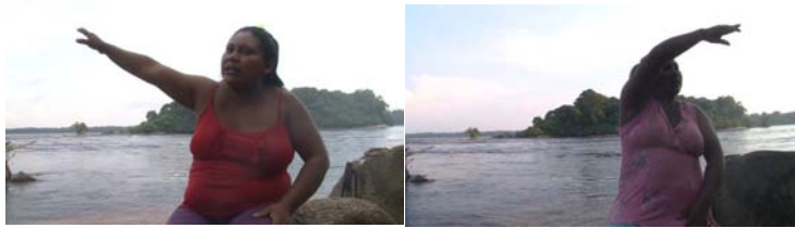
FIGURE 4. Stimuli ST5 and TC3, mirroring the images of the responses in Figs. 5 and 6.

Two examples of faithful repetition are illustrated below; since speakers were facing the screen, here they appear to mirror the clips they responded to. In the responses to stimulus ST5, all speakers pointed to around 7 AM or 8 AM (Figure 5), while for stimulus TC3, all speakers pointed to around 3 PM or 4 PM (Figure 6). The original stimuli are shown in Figure 4.