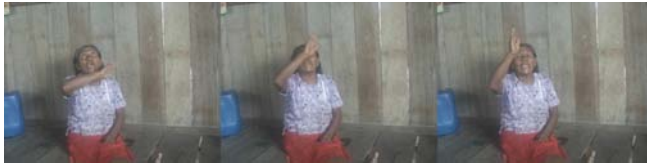
[<SWEEP He ‘waited’] [<SWEEP ‘until’] [POINT ‘noon’]

In contrast, when events are construed as having inherent duration, such as waiting until noon or dancing all afternoon, as in examples 4 and 5, they tend to combine with sweeping movements indicating a prolonged period of time.