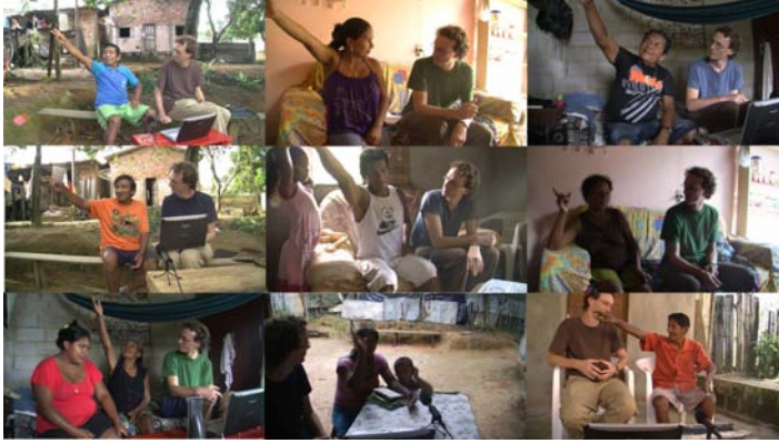
FIGURE 6. Nine participants' similar responses to stimulus TC3 (16:00 ± 1hr).

ful repetitions of the stimuli set including identical spoken elements but with visual elements that were modified in ways that departed from the natural speech examples, the rate of faithful repetition decreased to 34%. It might perhaps be expected that there would be no faithful repetition of modified stimuli at all, if these were not interpretable as successful time references, but in some cases speakers were able to resort to alternative interpretations of pointing for spatial reference, as evidenced in their translations, which added spatial but not temporal information. In any case, the faithful repetition rate dropped dramatically for modified stimuli. Compared to speakers' consistent treatment of both the auditory and visual elements of the unmodified stimuli as single integrated utterances, participants oriented to the visual elements in the modified stimuli to a much lesser degree, as summarized in Table 4.