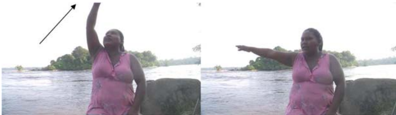
FIGURE 8. Well- and ill-formed stimuli: GR7A (left) with appropriate duration for ‘morning until noon’ and GR7B (right) with an inappropriate time.

The responses to GR7A and GR7B (Figure 8) show another instance of the same type of effect. The spoken element of the stimuli was the phrase ‘In the morning (s)he waited until noon’. In the unmodified stimulus the visual time reference was from the horizon until the sun’s zenith. In the modified stimulus the speaker pointed at the horizon but held her arm in position instead of raising it. In seven of nine cases participants faithfully repeated the visual/bodily elements of the unmodified stimulus, and in nine of nine cases they corrected the modified stimulus.