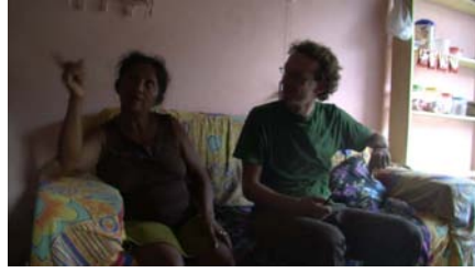
FIGURE 9. Response of participant 2 to stimulus TC3: 'She said that she would arrive in the afternoon.'

For scenarios in which all elements except for the time reference were consistent with reality, speakers consistently judged the stimuli as false. To express this they applied Portuguese words such as mentir 'to lie', enganhar 'to fool', or errar 'to be mistaken'. The responses to stimulus TC1 provide a good illustration of such judgments. In the clip the speaker says 'Children went to bathe until right here', indicating a period from around 7:00 to 11:00. I asked if the statement would still be true if the children had arrived at 17:00, and this was one participant's response: 'No, because, she said (they left at) seven right? They came out at eleven' ('Não, pelo que, ela falou sete horas mesmo, ne? Saíram só onze horas').