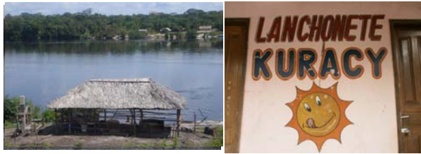
FIGURE 1. A processing house for the staple food, manioc, in a Nheengatú-speaking village (left). A day's travel upriver is the town of São Gabriel da Cachoeira, where elements of mainstream Brazilian society can be found, such as lanchonetes (snack bars) like that shown in the photo (right); this lanchonete takes its name from the Nheengatú word for 'sun'.

gatú spoken along a stretch of the Middle Rio Negro between the two towns of Santa Isabel do Rio Negro and São Gabriel da Cachoeira, founded as Salesian missions and today the seats of two adjacent administrative divisions. The varieties spoken upriver from São Gabriel, mainly by Arawakan peoples like the Baniwa and Werekena, are distinct from, but largely intelligible with, the downriver varieties. 7 Today Nheengatú is spoken, sometimes along with other languages, in many different villages in different indigenous reservations along the banks and islands of the broad Rio Negro and its many tributaries, as well as in the larger towns, which were historically Nheengatú-speaking centers until Portuguese gained currency in the region (see e.g. Figure 1). These towns have grown in recent years, linked to growth of the Brazilian military installations in the region as well as commercial activities like gold mining, and they have received much migration from the smaller communities in the area.