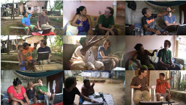
FIGURE 5. Nine participants’ similar responses to stimulus ST5 (8:00 ± 1hr).

As stated above, participants were given no instructions mentioning the visual modality, so the fact that they treated the visual elements in the stimuli as part of what was ‘said’ and thus part of its faithful repetition is evidence for how they perceive the auditory and visual modalities as integrated. The images in Fig. 5 and Fig. 6 also reflect what appears to be a high level of uniformity in understanding, as all participants targeted the same vector within a few degrees of variation. If we compare the rate of faith-