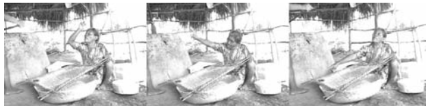
[<SWEEP ‘they dance’] [<SWEEP] [<SWEEP]