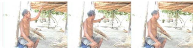
[POINT 'around noon'] [SWEEP>] [SWEEP>] [POINT 'six o'clock']