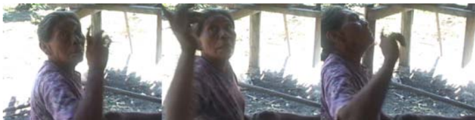
[POINT ‘here sun’]