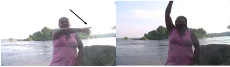
FIGURE 7. Unmodified and modified stimuli: GR6A (left) with appropriate time for ‘the day disappeared’ and GR6B (right) with a conflicting time reference.

In both stimuli GR6A (unmodified) and GR6B (modified), the speaker said ‘They went up (the river) and came back as the day disappeared’, but in the first she made an arc from east to west, while in the second she only pointed upward (see Figure 7). Since ‘the day disappeared’ ( ara ukāyemu ) is a common way of talking about nightfall, pointing to ‘noon’ was predicted to cause a semantic conflict in the modified stimulus. In line with the results discussed in §3.3, for the unmodified stimulus all nine participants produced a time reference sweeping east-west through the arc they had seen in the video. For the modified stimulus, by contrast, eight of nine participants also swept their hand from east to west, even though they had seen a different time reference in the clip.