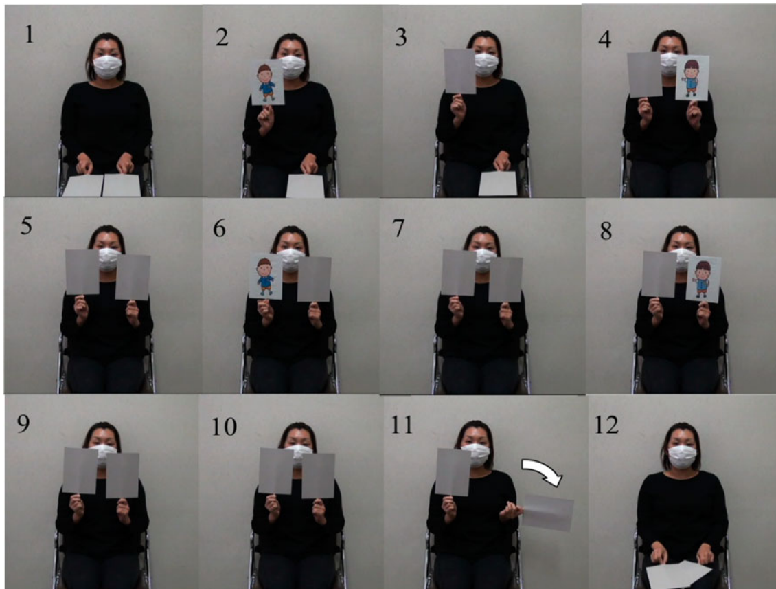
Figure 3. Example stimulus with hand-held (the Identifiable items) pictures used in Experiment 2 (regarding cohesive presentation of pictures).

Note: The vignettes were identical to Experiment 1, except that hand-held pictures replaced gestures. All symbols and abbreviations used in panels are identical to Figure 1. The numbers in parentheses in the top panel indicate where the action with the corresponding number in the bottom panel took place.