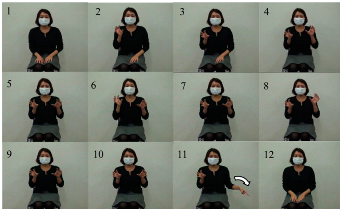
Figure 1. Example stimulus used in Experiment 1 (regarding cohesive gestures).

Note: The top panel (speech): Words in boldface are accompanied by a gesture and underlines indicate periods in which a gesture(s) was held in the air. The abbreviations in the interlinear gloss are ACC (accusative), DAT (dative), NOM (nominative), PST (past tense), PROG (progressive aspect) and TOP (topic marker). “Nori” and “Yuuto” are a common Japanese boy’s names. “kun” is a honorific for a young boy. The numbers in parentheses indicate where gestures occurred and correspond to the numbers in the bottom panel. Note that Japanese does not have articles or commonly used third person pronouns; thus, it is natural to use full noun phrases for maintained referents. It allows omission of arguments as in the third sentence. The bottom panel (gesture): Gestures that accompanied the speech stimulus in the top panel.