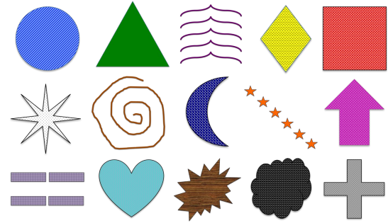
Figure 1: The meanings used in the experiment.

Stimuli for the experiments presented in this paper come from a previous experiment (Little, Eryılmaz, & de Boer, in press). In this experiment, participants produced signals for meanings varying in shape, colour, and texture, which were designed to have no shared features (explained in Little et al., in press). Figure 1 shows the 15 meanings used in the experiment. Theremin-like signals were created using a “Leap Motion” controller: an infrared sensor that detects hand position (see Eryılmaz & Little, 2016 for details of the paradigm). Participant’s hand position determined the pitch of audio signals. Left to right hand-positions created low to high pitches respectively with a non-linear, exponential relationship between hand-position and pitch. Participants were given this audio feedback in real-time as they produced the signals and participants could not see each other as they produced signals. These signals were used because they share some qualities with speech: they are auditory, continuous and restrict the use of iconicity. At the same time, they are non-linguistic and so minimise possible interference from pre-existing linguistic knowledge and conventions.