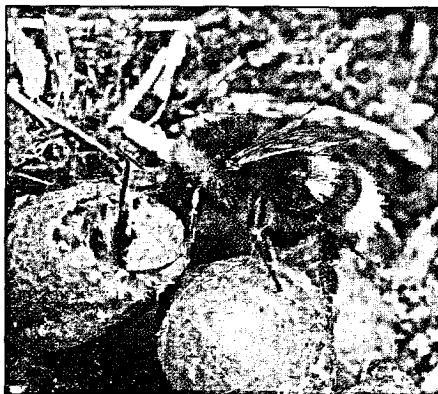
Bumblebees pay a hidden survival cost when their immune system is activated.

In mammals, it has been shown that the adipocyte-derived hormone leptin is a regulator of metabolism and bodyweight (1). An important physiological role of leptin is as a signal of starvation, in that a falling serum leptin concentration leads to neurohumoral and behavioral changes that seek to preserve limited energy reserves for immediately vital functions (2). It has been proposed that reduced leptin levels during conditions of starvation lead to impaired reproductive, thermogenic (2), and immune capabilities (3). One of the key features of the innate immune response is that its response is the same on each subsequent exposure to a certain stimulus, whereas the cognate immune system shows markedly different responses upon subsequent reexposure to a particular antigen. Indeed, the cognate immune response is far more energy-expensive than the in-