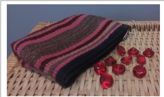
FIGURE 2 | The ten gemstones used as spoils.

take some again!” To make sure that children understood that the puppets were not entitled to take the gemstones, the other puppet was skeptical and pointed out that the gemstones did not belong to them. In order to convey the idea that this was something this group did regularly, the first puppet said “But we are members of the yellow/green group, and the yellow/green group always does it like that!” The female puppet then replied, “Ok, then let’s have a look. But let’s be quick and quiet, so that no one will catch us!” They then opened the purse and admired the gemstones. Depending on the condition, they took either one (mild transgression) or nine of the ten gemstones (severe transgression). In the mild condition they said to each other, “Let’s take only a little bit, only one gemstone. There are still many left, certainly no one will notice!” In the severe condition they said, “Let’s take a lot of them, nearly all the gemstones. There is still one left, certainly no one will notice!” After they put the gemstone(s) into their purse, M called them from the outside, “[Transgressor puppets’ names], where are you?” The puppets replied to M, “We are coming,” and then said to themselves, “Let’s leave quickly, so that no one will catch us!” Finally, before leaving the room, they asked the child to wait inside.