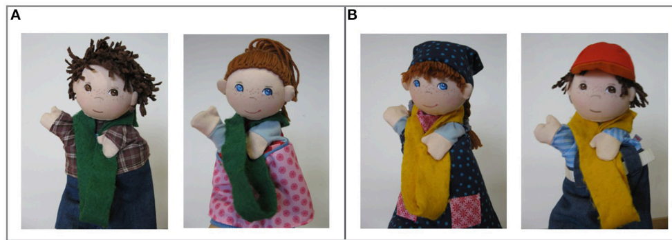
FIGURE 1 | The puppets used in this study. (A) The transgressors played by E1 (here wearing green group markers), (B) The puppets played by E2 (here wearing yellow group markers).

in the outgroup condition the child was allocated to the other group.