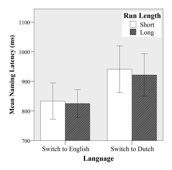
Figure 2. Mean naming latency of correct responses on critical switch trials, grouped by language (switch to English vs. switch to Dutch) and run length (short vs. long). Error bars indicate 95% CI.

Other error rate. There were no statistically significant effects of language or run length on other speech errors (all ps > .092; see Figure 1, right panel).