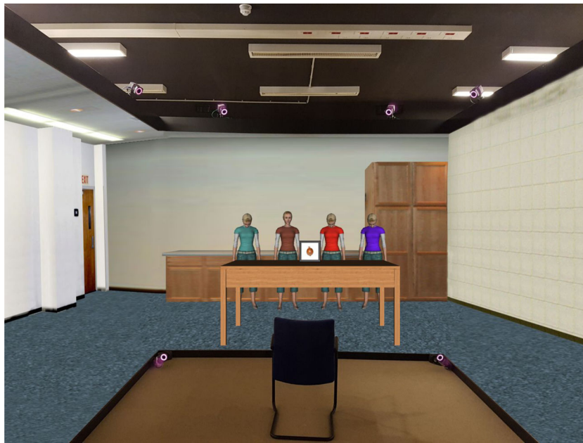
Fig. 2 Example of a CAVE setting in which an experimental participant can be immersed into a virtual environment to interact with virtual objects and avatars. Participants wear shutter glasses that present the virtual world

validity in that their results may not be representative of individuals' real-world functioning (Chaytor, Schmitter-Edgecombe, & Burr, 2006; Parsons, 2015). As an alternative, tests of individual differences may be carried out in virtual environments resembling the real world (e.g., Renison, Ponsford, Testa, Richardson, & Brownfield, 2012) before being correlated with measures of language processing and behavior.