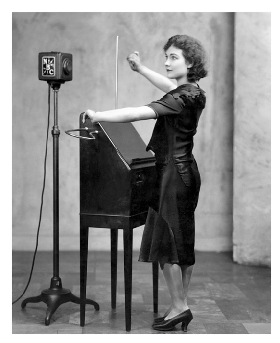
Fig. 2. Playing theremin is an alternative example of how movement flexibility can affect sound production. Here, the player moves her hands around the musical instrument to shape the sounds it produces. What we call the "theremin model of speech control" is based on the idea that, while the vocal tract of participants in ref. 1 provides a sound flow (much like the depicted theremin), hand movements of participants in ref. 1 can modulate and control this flow (similar to what the theremin player does). In a (highly dexterous) musical duet of two theremin performers, the movements of players might also synchronize by sound alone, akin to the voice-mediated movement synchrony in Pouw et al.'s experiment (1), but without enhanced vocal control.