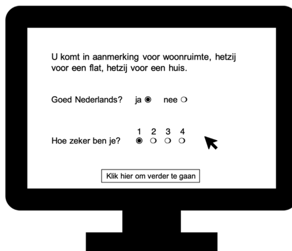
Fig. 1. Illustration of test interface. Participants had 20 s to answer both questions.

Written instructions at the start of the test included five example trials, with Ja/Nee responses completed as appropriate. Two of the examples were foils. The purpose of the example trials was to demonstrate that the question “Goed Nederlands?” entailed a grammaticality judgement, hence calling attention to the syntactic form of the sentences. Participants had the opportunity to seek clarification from the experimenter after reading the instructions. The test took approximately 30 min.