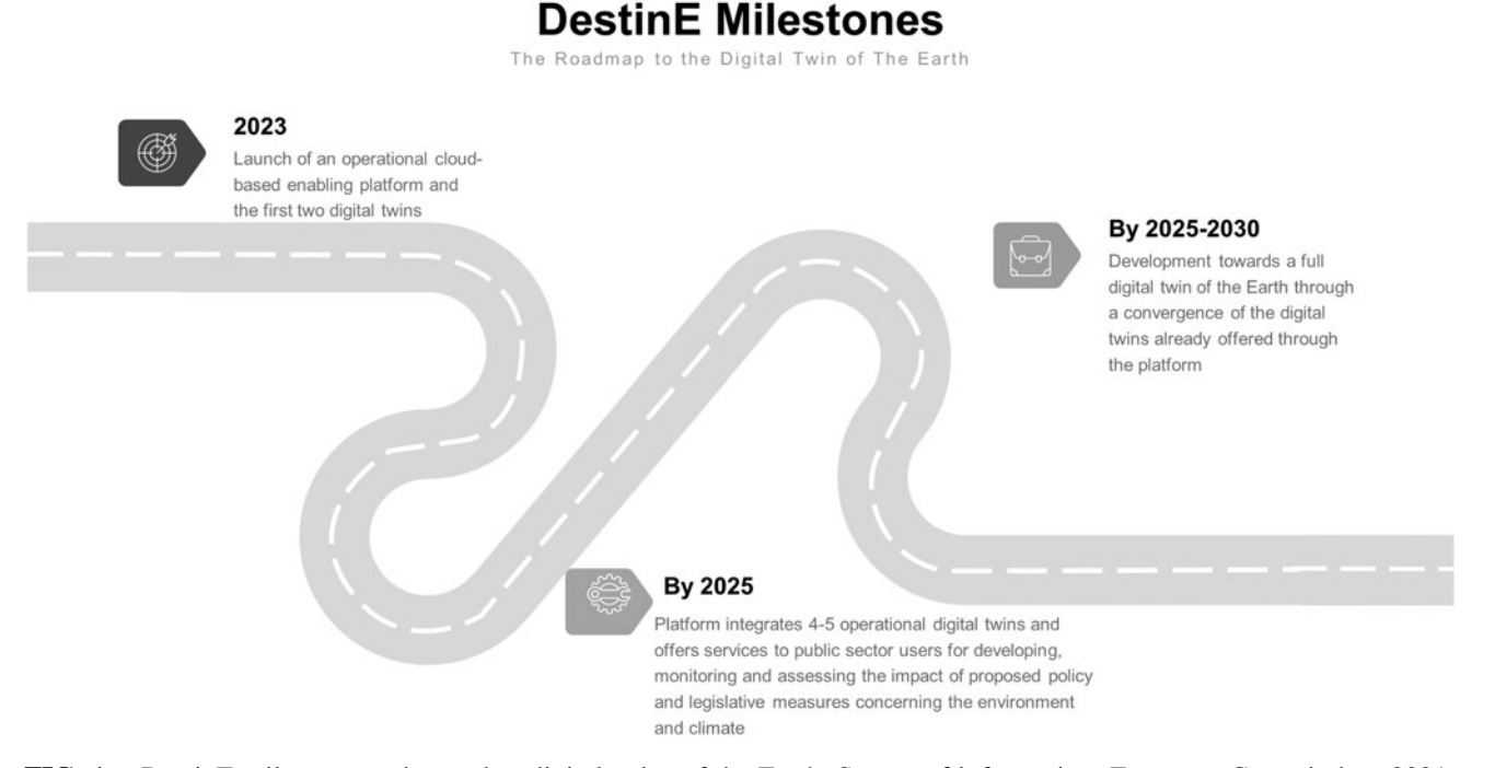
FIG. 1. DestinE milestones—the road to digital twins of the Earth. Source of information: European Commission, 2021. DestinE, DestinE, Destination Earth.

planetary health crises looming on the horizon. Omics systems science offers veritable prospects for genomic surveillance of emerging pathogens, including new zoonosis threats. Omics is itself undergoing digital transformation impacting nearly all dimensions of the field, including realtime phenotype capture to data analytics using machine learning and artificial intelligence, to name but a few emerging frontiers.