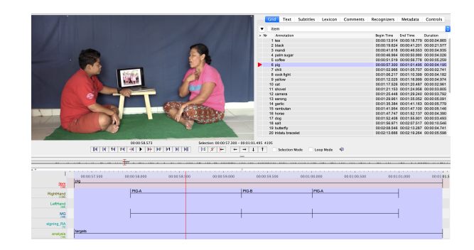
Figure 1: Example of annotation using ELAN: a participant responds to the stimulus pig

The picture description task consisted of 36 culturally relevant stimuli from various semantic domains: animals, food, religion, colors and a miscellaneous category. Based on Lutzenberger and de Vos's knowledge of KK (both are fluent KK signers), as well as ongoing work documenting KK (Lutzenberger, 2021), we expected differences in the number of variants that each stimulus would elicit. For some stimuli, we expected few to no variants (e.g. dog ), and for others we expected a larger number of variants (e.g. dragonfruit ). A deaf research assistant from the KK community led the picture description task, asking participants what each stimulus is in KK. The participants' responses were videotaped.