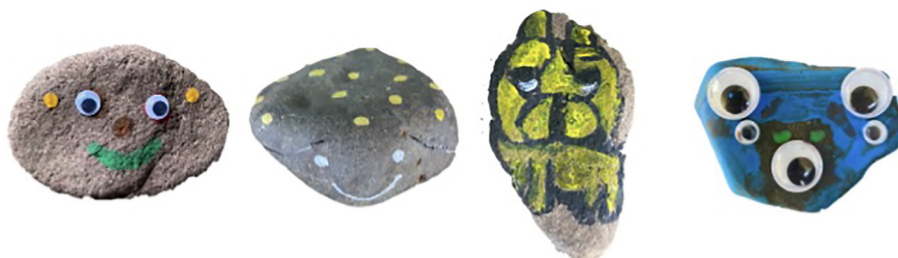
Fig. 2. Example rocks decorated by participants, organized by humanness ratings.