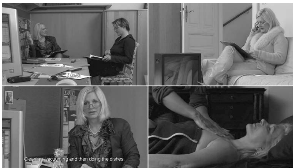
Figure 7: Kurz davor ist es passiert , Austria, 2006

Every event that documentary film pretends to represent always happened “just before” we can see its image on a screen. Instead of the illusion of sharing the migrant's perspective for a moment in film, Salomonowitz disturbs the spectator and forces her or him to double-read the film. The images represent their protagonists' daily life and they sharpen the viewer's sense for what is invisible in this representation and in all our ordinary daily life as well. Film becomes no longer a medium of recognition but of cognition. The evacuation of the migrants' bodies from the images is the price Salomonowitz has to pay for showing the invisibility. However, it is not only a price to pay, but opens up new perspectives beyond the un-