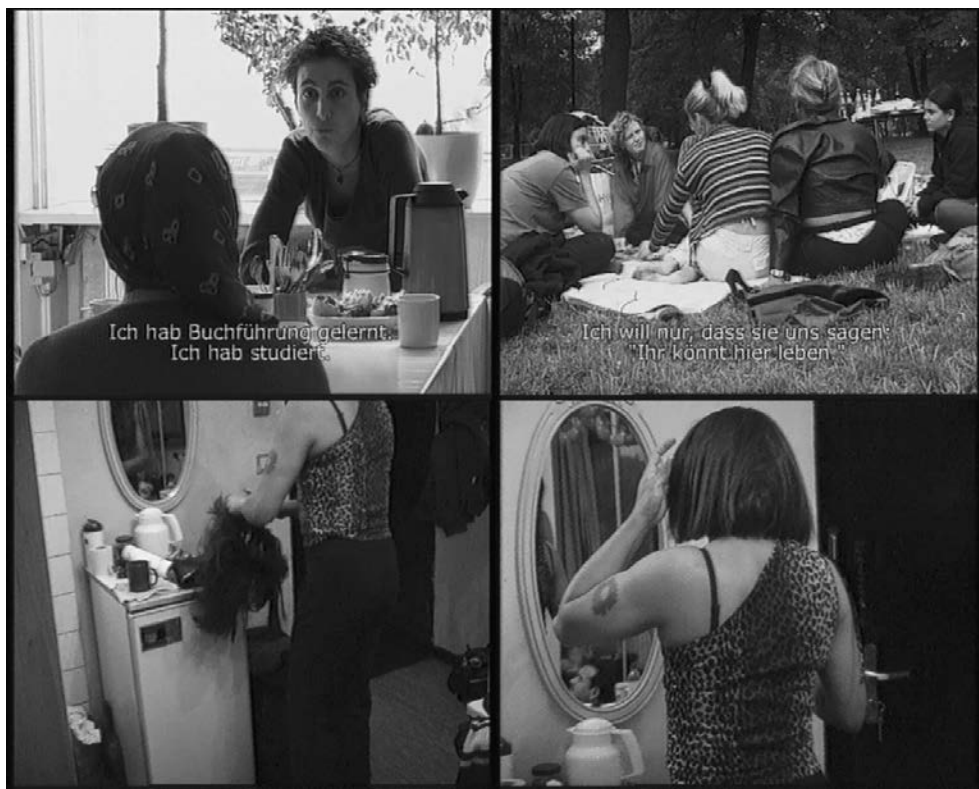
Figure 4: Otras vías , Germany 2003

In another scene, one of the migrant sex workers is shown in front of a mirror while dressing up as a transvestite. It appears probable—as in the case of the domestic worker who cleans the flat in Haus-Halt-Hilfe —that the viewer is standing behind the person who is dressing himself up. The camera position has definitely something voyeuristic, but the migrant, while shown from the back, clearly communicates through his movements towards the